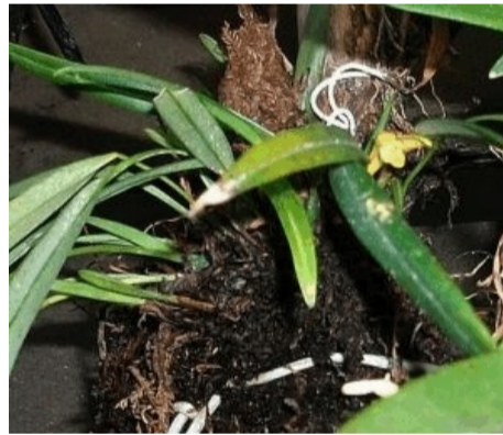
Maxillaria ? 96-?