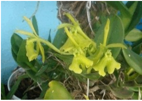
Epidendrum difforme 61-26