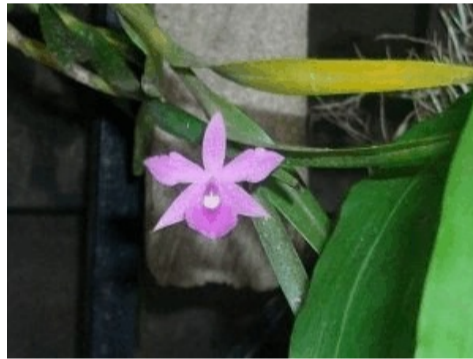
Dimerandra emarginata 52-2