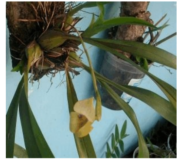
Trigonidium egertonianum 162-1