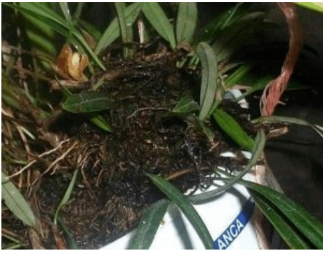
Maxillaria ? 96-?