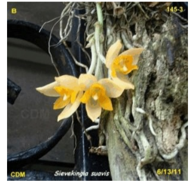
Sievekingia suavis 145-3