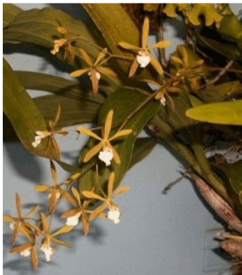
Encyclia stellata 59-9