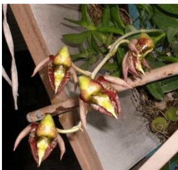
Catasetum oerstedii 26-4+