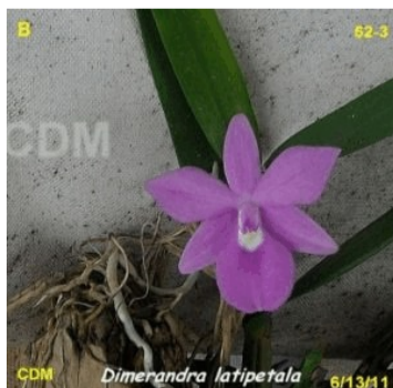
Dimerandra latipetala 52-3