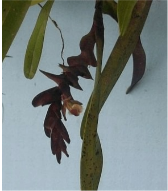
Epidendrum allochthonum 61-5 NS