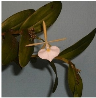
Epidendrum eburneum 61-27