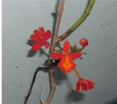
Epidendrum radicans 4 61-62