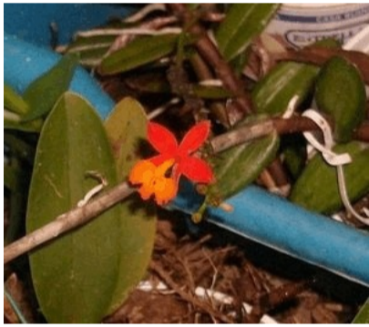
Epidendrum radicans 6 61-62