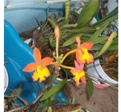
Epidendrum radicans 5 61-62