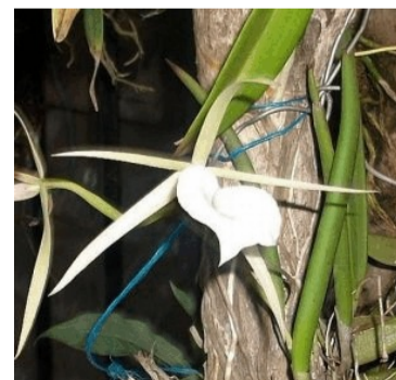
Brassavola nodosa 23-4 "CDM"