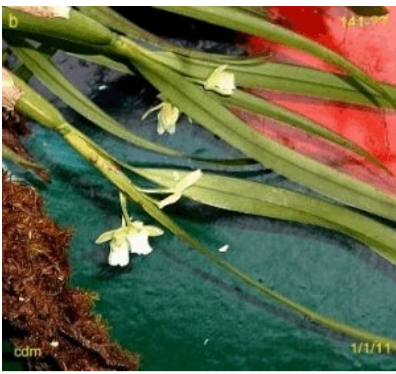
Scaphyglottis ?? 141-?