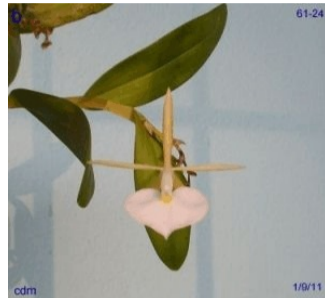
Epidendrum eburneum 61-27 "Bloomin Fool"