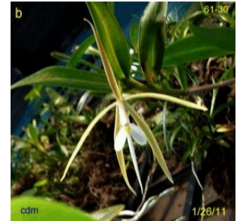
Epidendrum nocturnum 61-48