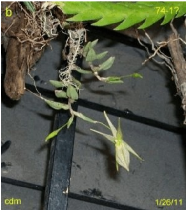
Homalopetalum pumilio 74-1 NS