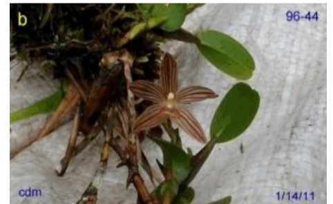
Maxillaria lankesteri 96-50