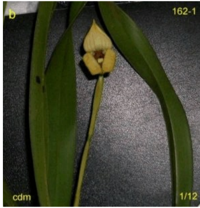
Trigonidium egertonianum 162-1