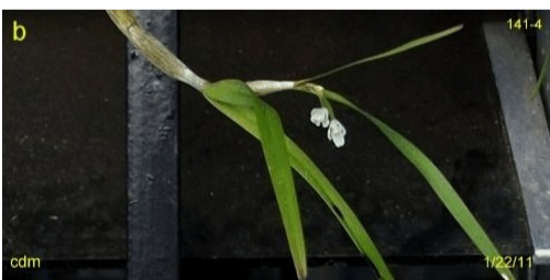
Scaphyglottis behrii 141-4

January 2011, my balcony, David, Panama' NS = did not survive at sea level. Many of the plants were taken from areas between 800 and 1800 meters altitude The camera is not designed for this type of photography, but we must use what we have