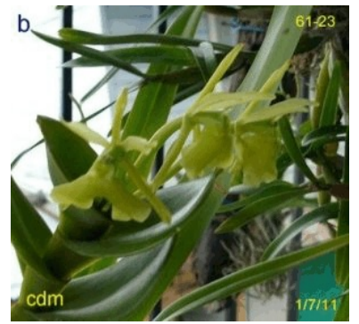
Epidendrum difforme 61-26