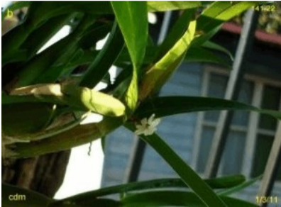
Scaphyglottis prolifera 141-22