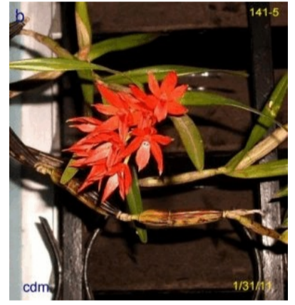
Scaphyglottis bidentata 141-5