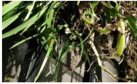
Scaphyglottis acostea 141-1 NS