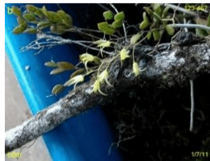
Pleurothallis ? 123-? NS