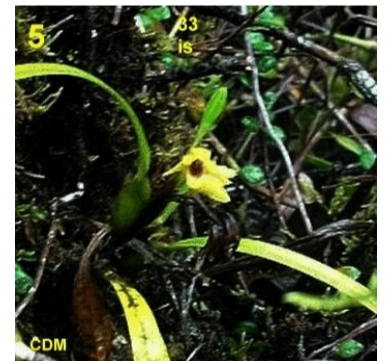
Maxillaria ? 1