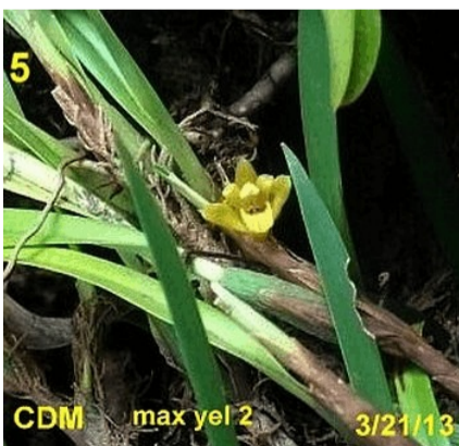
Maxillaria ? 2