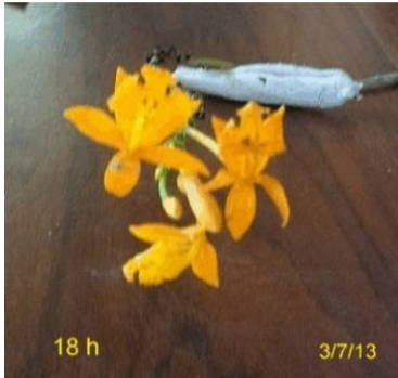
Epidendrum radicans = 27 clones from yellow to red, most orange