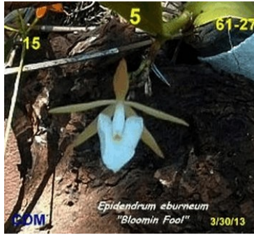
Epidendrum eburneum "Bloomin Fool"