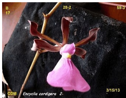
Encyclia cordigera 2