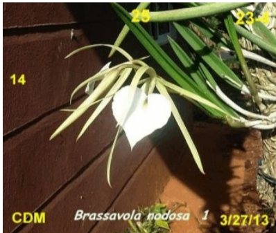
Brassavola nodosa 1