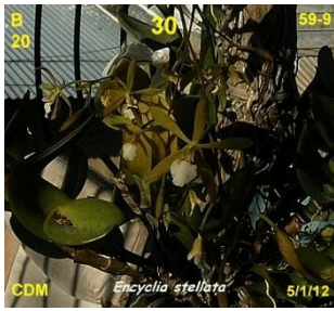
30 Encyclia stellata