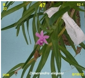
47-1 Demerandra elegans 1