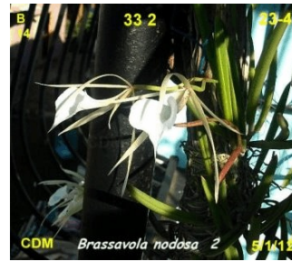
33b B. nodosa 2