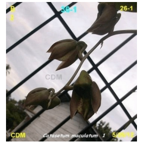
36-1 Catasetum maculatum 1