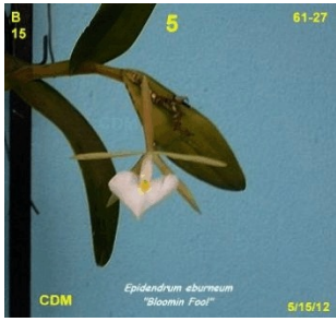
5 Epidendrum eburneum "Bloomin Fool"