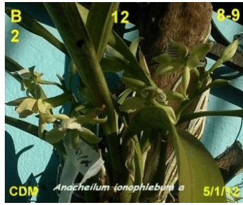
12a Anacheilum ionophlebium A