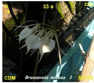
33a Brassavola nodosa 1