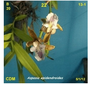
22 Aspasia epidendroides