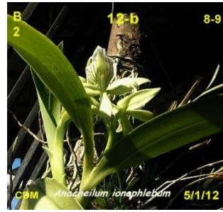
12b Anacheilum ionophlebium B