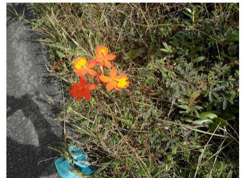
Epidendrum radicans 21 61-62