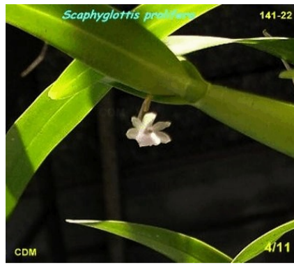
Scaphyglottis prolifera 141-22