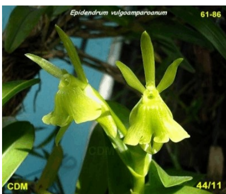
Epidendrum difforme 61-26