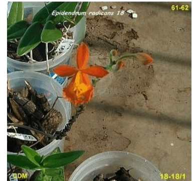
Epidendrum radicans 18 61-62