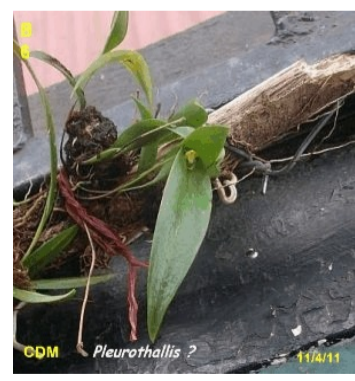
Pleurothallis ? 123-?