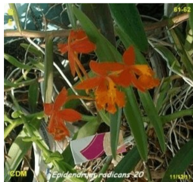
Epidendrum radicans 20 61-62