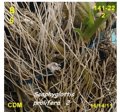
Scaphyglottis prolifera 2 141-22