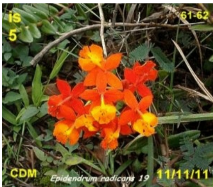
Epidendrum radicans 19 61-62