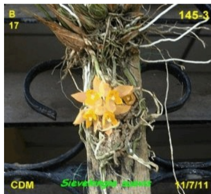
Sievekingia suavis 145-3