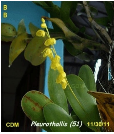
Pleurothallis quadrifida 123-80