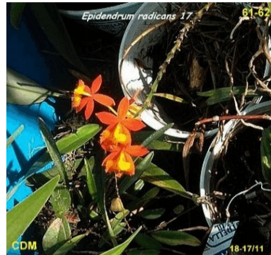
Epidendrum radicans 17 61-62