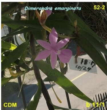
Dimerandra emarginata 52-2