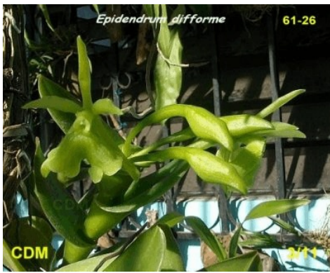
Epidendrum difforme 61-26