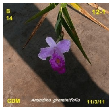
Arundina graminifolia 12-1