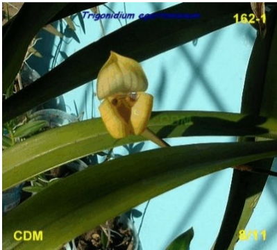
Trigonidium egertonianum 162-1